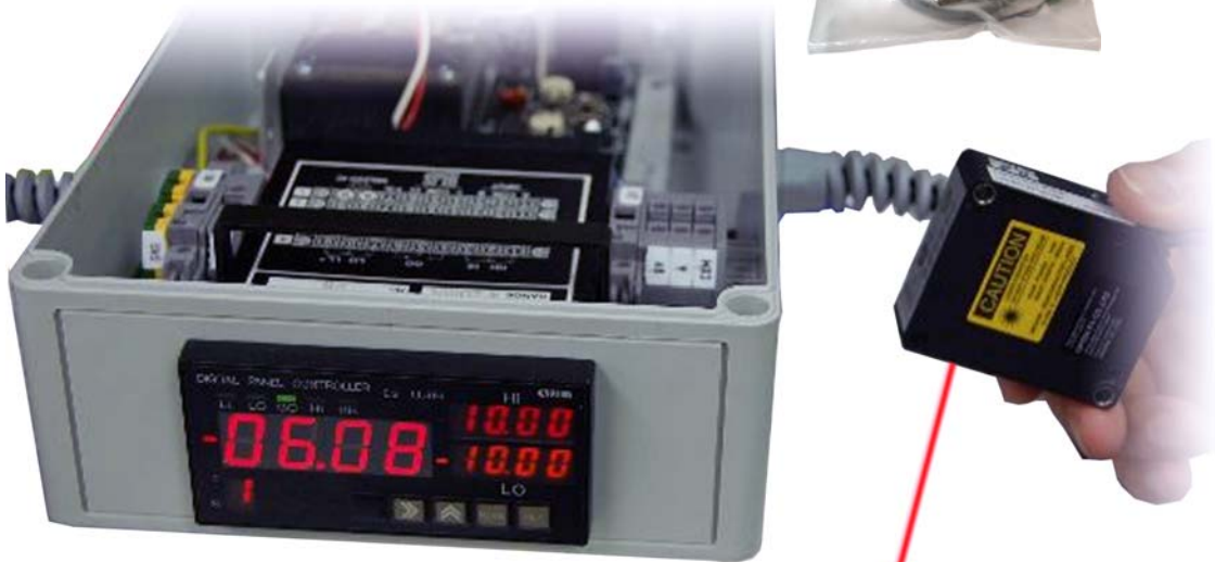
Example of a turn key solution wiring and pre-programming our laser sensor and panel meter.